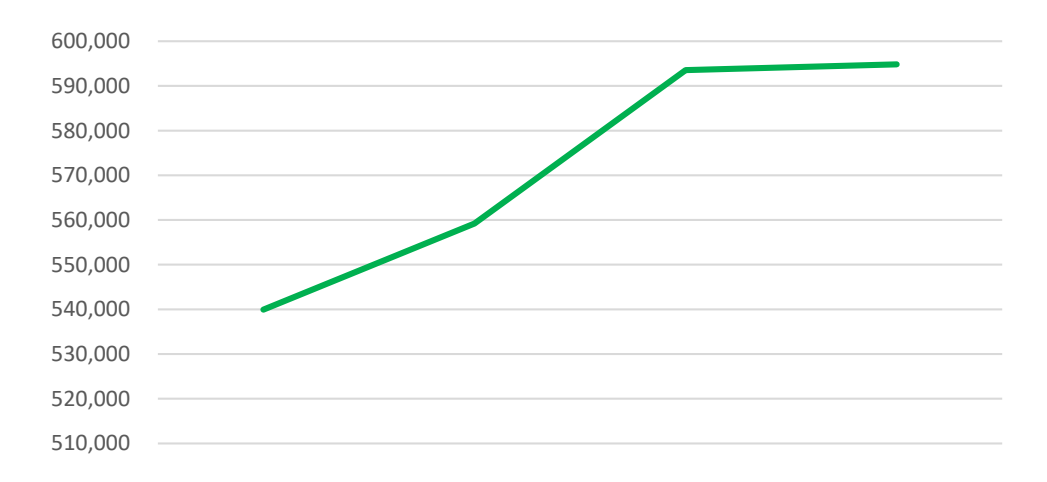
Long-term sickness due to Mental Health between 2019 and 2022

Poor nutrition leads to absenteeism, sickness, low morale and workplace accidents.